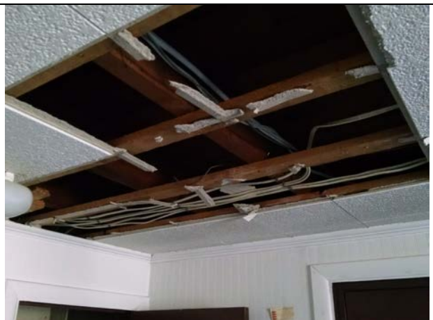
No suspect materials above ceilings