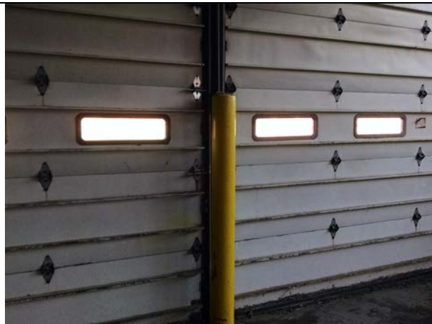
Lead paint on safety posts