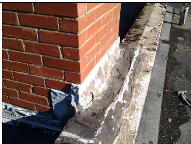
Asbestos-containing tar flashing on chimney