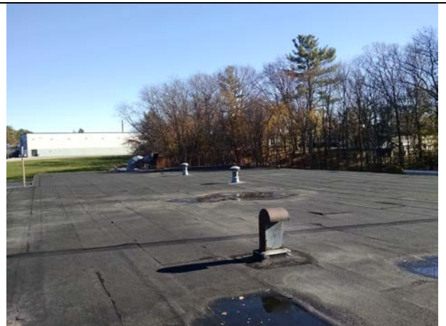
Asbestos-containing roofing on main roof