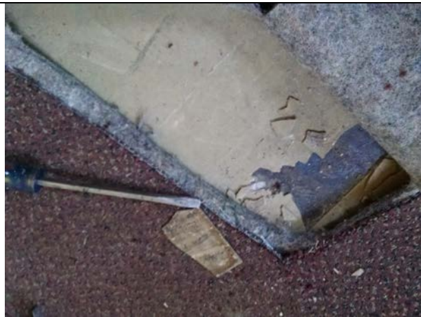
Asbestos-containing flooring/leveler under carpet