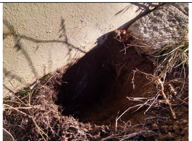
No waterproofing observed on foundation