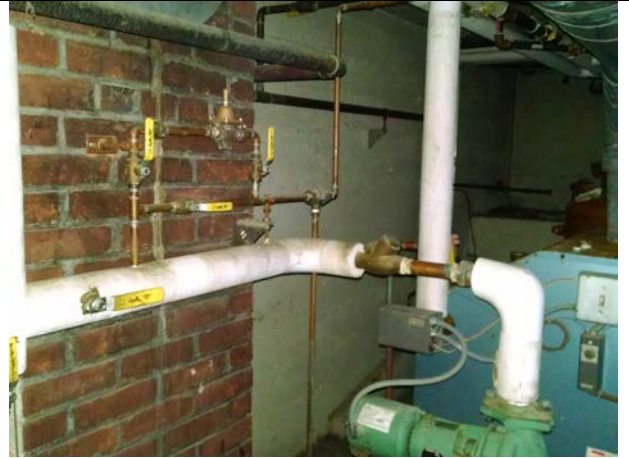
Fiberglass insulation in boiler room