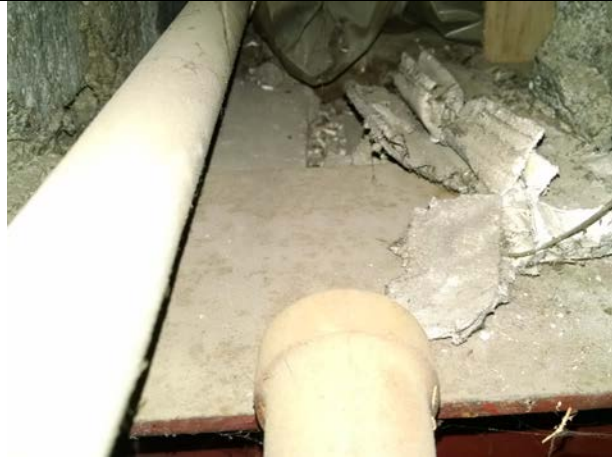
Asbestos-containing pipe insulation debris