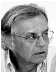
May 1 7:30 - 9 p.m.