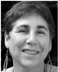
** date change ** April 10 7:30 - 9 p.m.