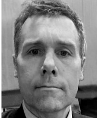
March 6 7:30 - 9 p.m.